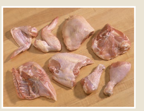
8-Piece Cut Broiler

The whole broiler is cut into 2 breast halves with ribs and back portion, 2 thighs with back portion, 2 drumsticks and 2 wings. The parts are packaged and labeled whole cut-up chicken. Cut-up broilers are usually sold without giblets.