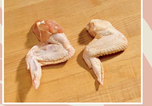
Whole Chicken Wing The whole wing is an all white meat portion composed of three sections: the drumette, mid section and tip.

Whole Broiler Leg A whole broiler leg is the drumstick-thigh combination. The whole leg differs from the leg quarter in that it does not contain a portion of the back. One leg-thigh combination is considered a serving.