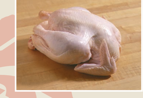
Roaster One of the larger varieties of whole chickens, roasters may be marketed with or without giblets.

Note that the majority of U.S. broiler processing plants employ personnel certified to slaughter birds using methods that strictly comply with religious requirements.