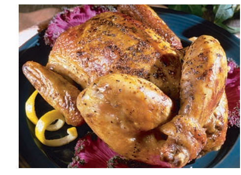
Whole Cooked Chicken Available baked, smoked, barbecued or roasted, fully cooked whole chickens are marketed hot from the deli. Vacuum packaged, fully cooked, refrigerated chickens need heating to become a meal in minutes.