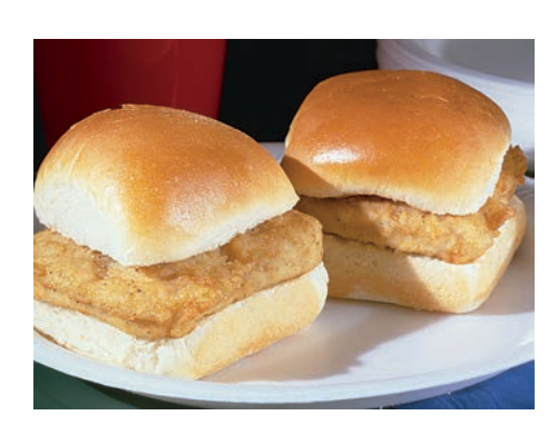
Mini-Biscuit Chicken Sandwiches These mini-biscuits contain a breaded chicken patty made from white and dark meat. They come packed in a single serving with two biscuits, ready for the microwave and great for the snack area in convenience stores.

Chicken Frankfurters, Bologna & Sausage Chicken frankfurters are a blend of mechanically deboned white and dark meat. Chicken bologna is cured, seasoned and mechanically deboned chicken meat. Cocktail franks are miniature chicken frankfurters. Chicken sausage is available in a variety of shapes, types and sizes, including breakfast sausage.