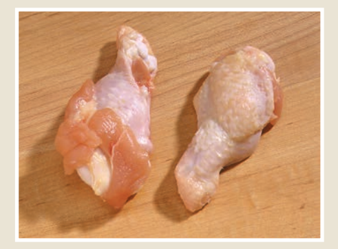
Chicken Wing Portion Drummettes The first section between the shoulder joint and the elbow.