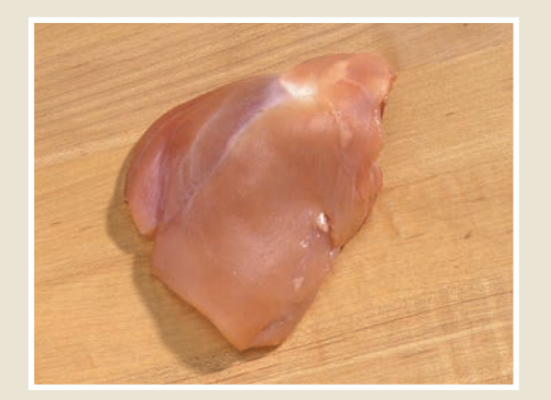
Boneless, Skinless Thigh Meat This cut is produced by removing the skin and bone from only the thigh portion of broiler leg quarters.

The broiler thigh is that portion of the leg above the knee joint. The broiler thigh with back portion is produced by separating the broiler leg quarter at the knee joint. The broiler thigh without back portion is produced by separating the whole leg at the knee joint. This cut must contain no rib, or back meat.